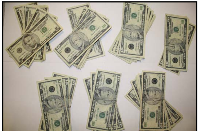
U.S. currency recovered from Wildberger