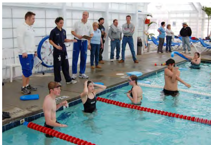
Junior Beach Patrol Assistant Instructor Try-outs at Ocean Pines.