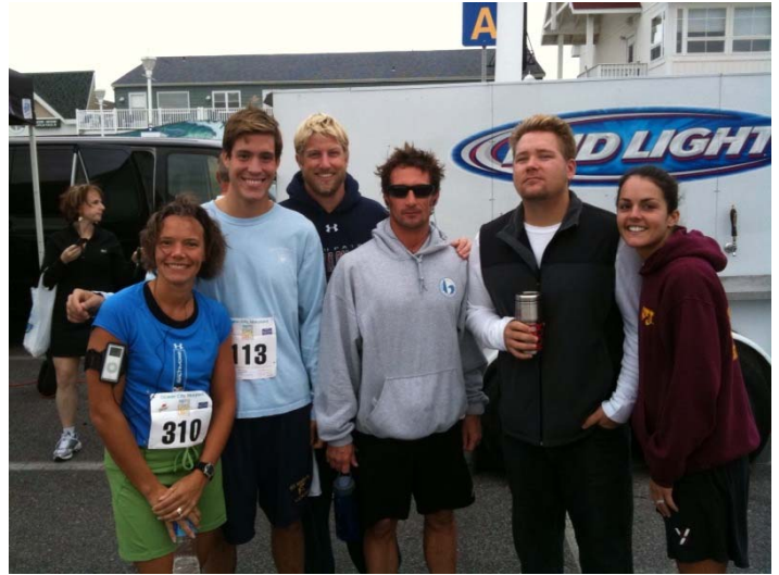
Seaside 10 Miler

Therefore, whether you are a returning veteran or a rookie, each additional day that you are available helps in securing a position on the 2010 roster. Start planning now!