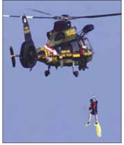
An OCBP member is lowered from the MSP helicopter during training.

Since the most dangerous time for swimmers at the beach is in the evening, after the lifeguards go off duty, MSP and OCBP discussed the plan of using guards during extended evening patrols to look for rip currents from above so that they could then radio information to emergency responders on the ground. Talks progressed to the idea of actually deploying a swimmer from the helicopter.