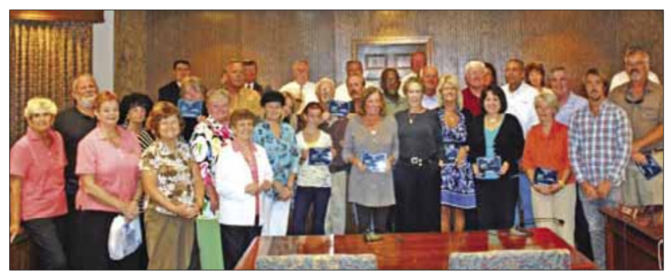
The recipients of the 2011 Beauty Spots Awards were recognized in September by the Mayor and City Council.