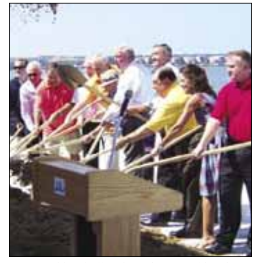
State and local officials at the ground-breaking.